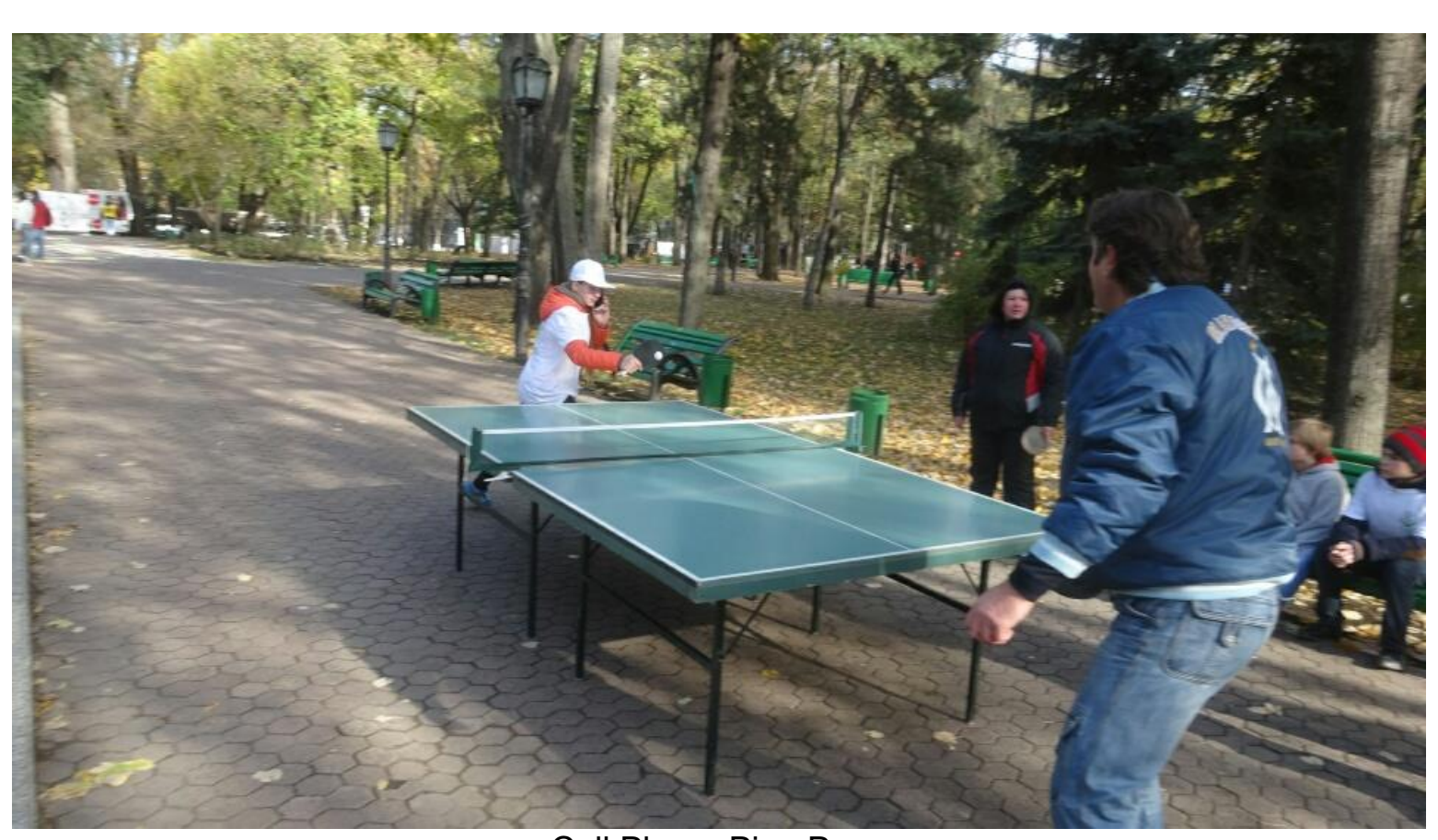
Cell Phone Ping Pong